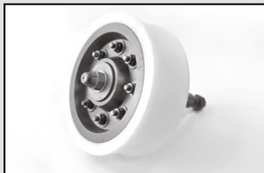
Roller for amusement parks